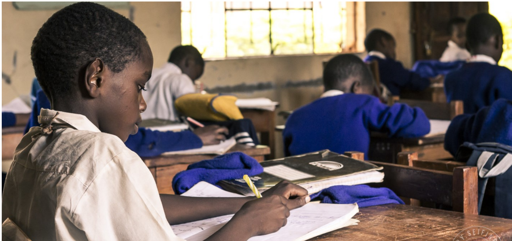
Pupils during a class lesson at Msafiri Primary School.

The Ministry of Finance unveiled significant investments in the Education Sector for the upcoming financial year, allocating billions of shillings to revitalize university research and overhaul technical education curricula.