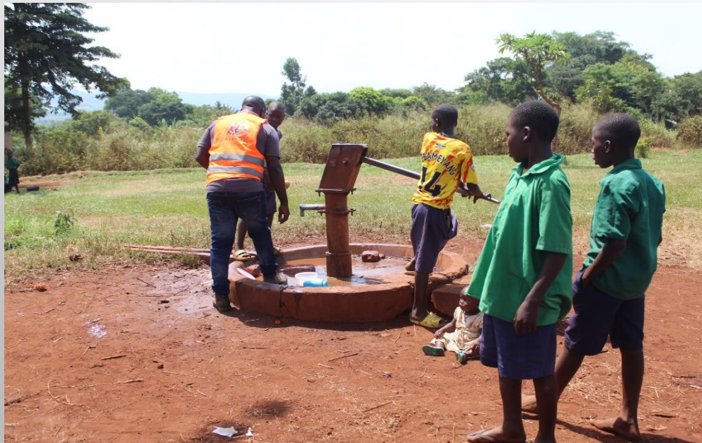
Poor hygiene of the borehole at Kinywamurara Primary School- Masindi District