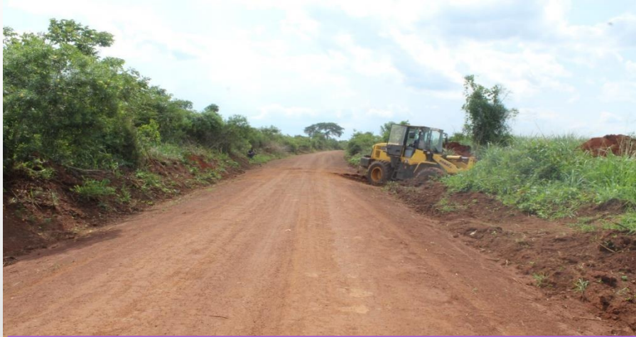
Nyambindo-Kitwetwe(7.6kms) road- Masindi District