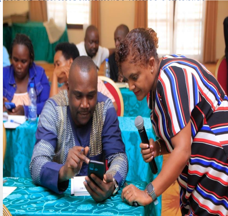
Some of the CSO Participants trained on the use of the Citizen Feedback Platform by CSBAG and the OAG in Mbarara, Sept 2023.

The primary objective of the Citizens Feedback Platform is to facilitate data collection and analysis, informing the planning, execution, and reporting of audits, while also improving public access to audit products and enabling citizens to actively follow up on audit issues