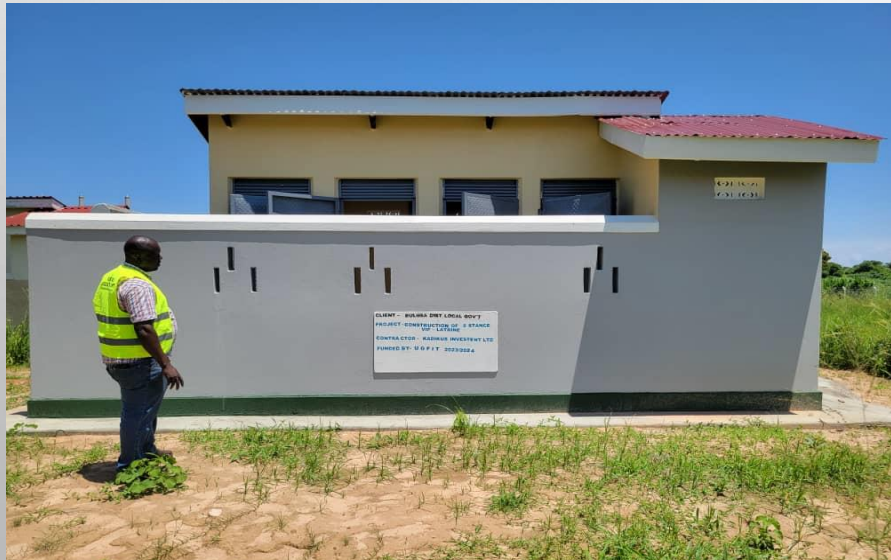
A 5 stance VIP latrine constructed at Kibambura P/s- Buliisa District