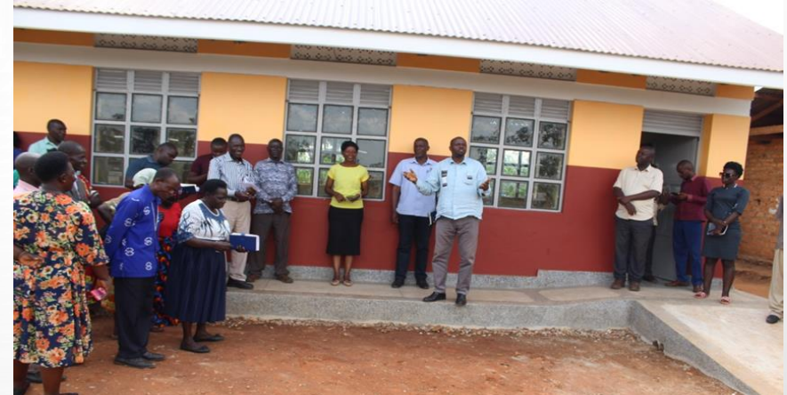
A two-classroom block constructed at Nyambindo Primary School- Masindi