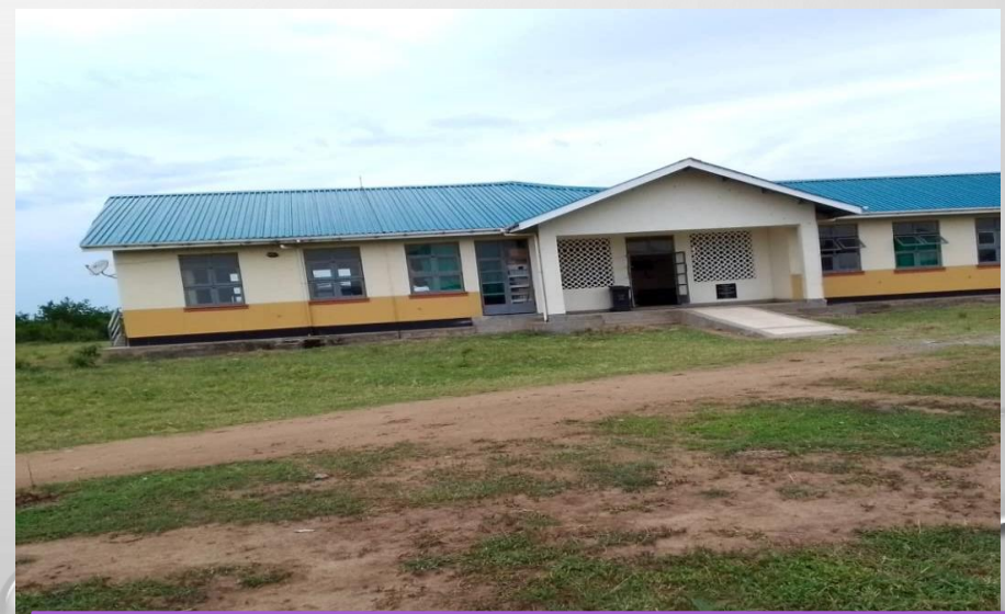
Constructed Butiaba Health Centre III, Butiaba S/C- Buliisa District