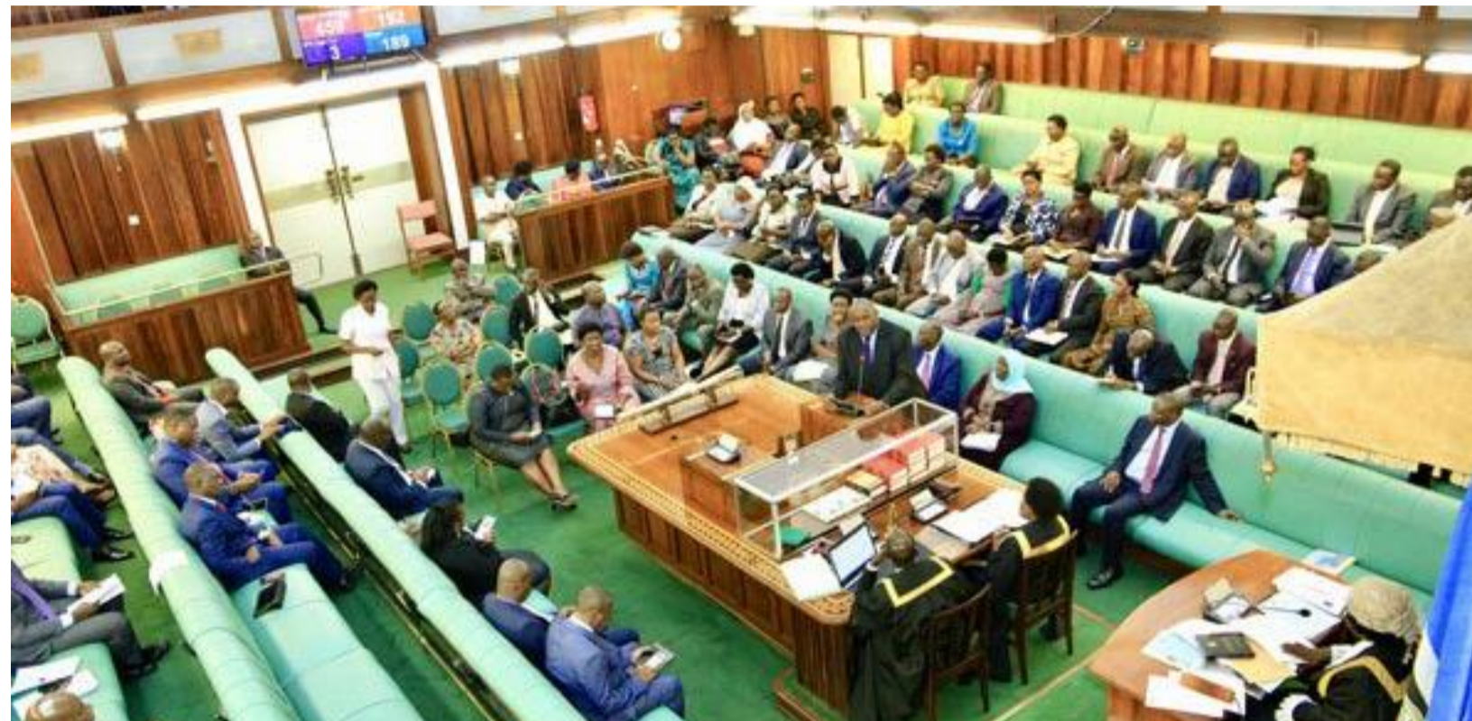
Members of Parliament during a plenary session at Parliament. In a unanimous decision, a coram of seven judges of the Supreme Court upheld a 2016 Constitutional Court verdict that declared Section 5 of the Parliament (Remuneration of Members of Parliament) Act unconstitutional.

"Anybody who wants to create a charge on the consolidated fund must first inform Government; Article 93 of the Constitution is meant to achieve that," Supreme Court ruled on July 25, 2019.