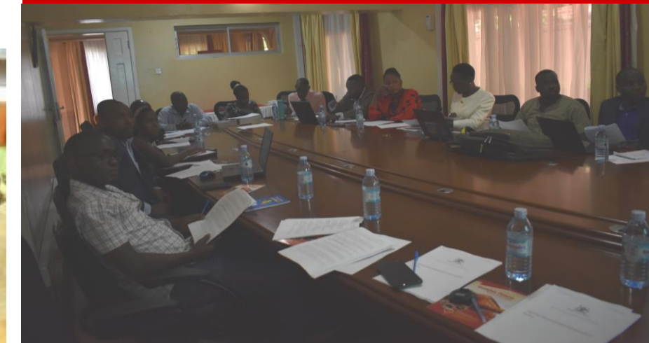
CSOs participating in a strategic meeting to generate comments for the draft Uganda Development Cooperation Policy in Kampala on 7 th August 2019.