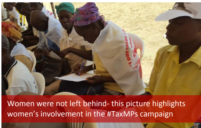
Women were not left behind- this picture highlights women's involvement in the #TaxMPs campaign