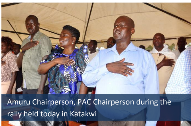
Amuru Chairperson, PAC Chairperson during the rally held today in Katakwi