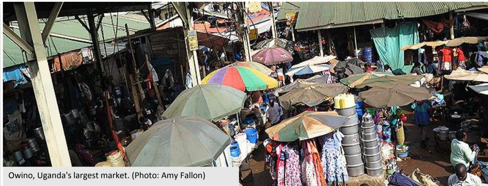
Owino, Uganda's largest market.

What is undisputed is the fact that this is a tax measure as well as an industry management policy measure based on the deliberations of EAC as evidence by the EAC Communiqué from the said summit signed 2 nd March 2016.