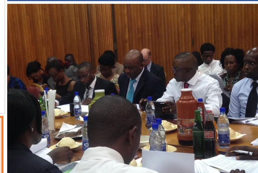
CSBAG members presenting CSO taxation proposals FY 2016/17 to the Parliament Finance committee at Parliament, on 30 th March 2016