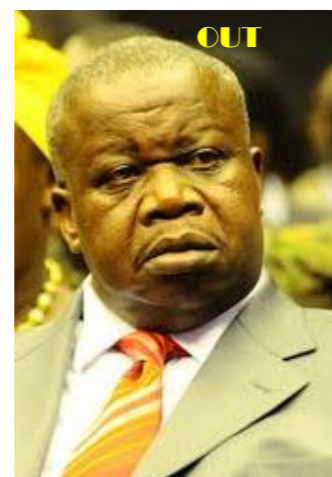
Hon. Tress Bucanayandi

When he was appointed as Minister for Agriculture, most comments from the public were not as positive. To many, it was a confirmation that the Ministry of Agriculture was indeed an abandoned sector otherwise why would the President have selected him amidst very many young and energetic Ugandans. Well just to comfort those worried comrades, voters in Kisoro specifically Bufumbira South have relieved you by bringing back Hon. Sam Bitangaro