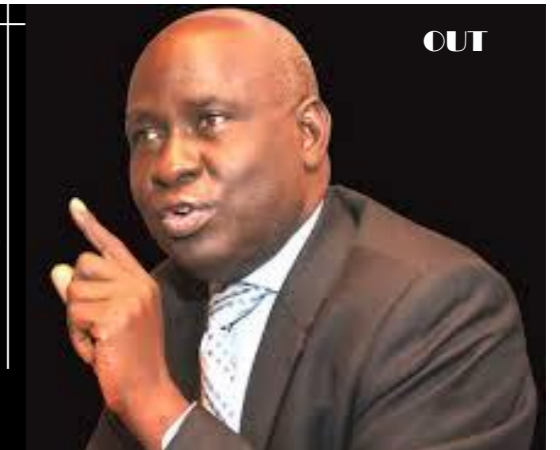
Hon. Wafula Oguttu

As Leader of Opposition, he without the unnecessary bureaucratic delays provided us space to engage the Shadow Cabinet during the campaign against taxing Agriculture inputs. From this, many of the Shadow Ministers joined campaign and voluntarily collected farmers' signatures which were later presented to the Speaker of Parliament in 2014. In addition, he was among the very few MPs that turned up for plenary to discuss and challenge the Public Finance Management (Amendment), Bill 2015 while others stayed in their constituencies to canvass for votes.