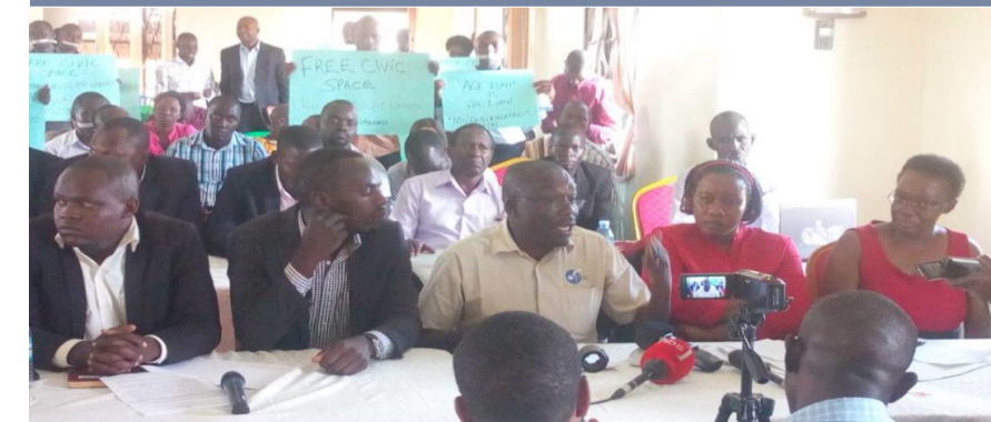
Members of Civil Society Organisations (CSOs) at a meeting to deliberate on Civic space and the proposed Constitutional amendments. They called on Government to exercise restraint and respect their contribution towards the country's development. | @CSBAG2017