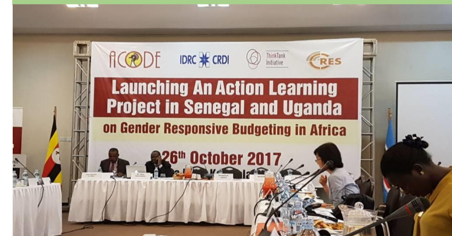
CSO members attending the launch of the Gender responsive budgeting project at Protea Hotel in Kampala last week. | @CSBAG2017