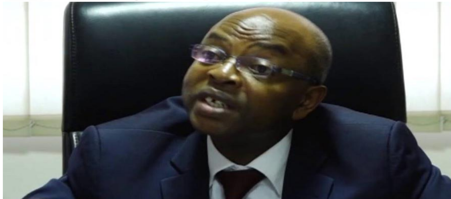
Professor Augustus Nuwagaba speaking recently. He has called on Government to invest more in agricultural value addition and post-harvest marketing for improved agro-business and economic development that can bring about poverty eradication | @CSBAG2017

----- "More Ugandans are slipping into poverty with the number of poor people increasing from 6.6 million in 2012/13 to 10 million in 2016/17, according to the UNHS report -----