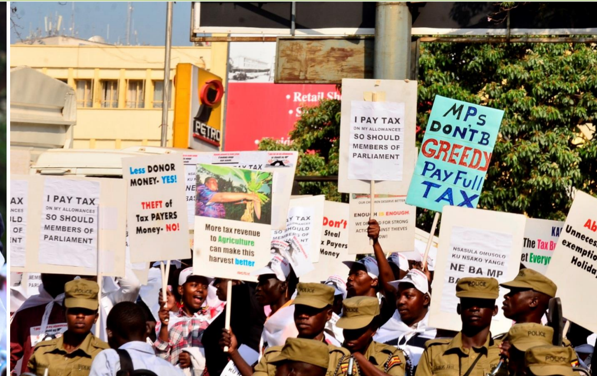
Citizens with Placards, marching along Jinja road accompanied by the Police Band