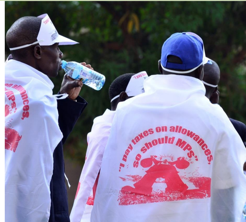
Citizens in campaign attire displaying a clear message on what Government should do as a result of the campaign

In this week edition we share with you the pictorial of the citizen Match.