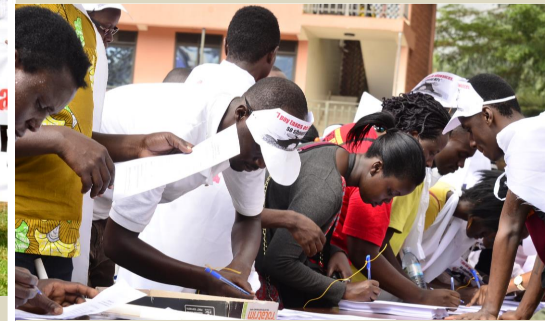
Citizens @ UMA show grounds signing open letters to the President. 300 letters and more were signed.