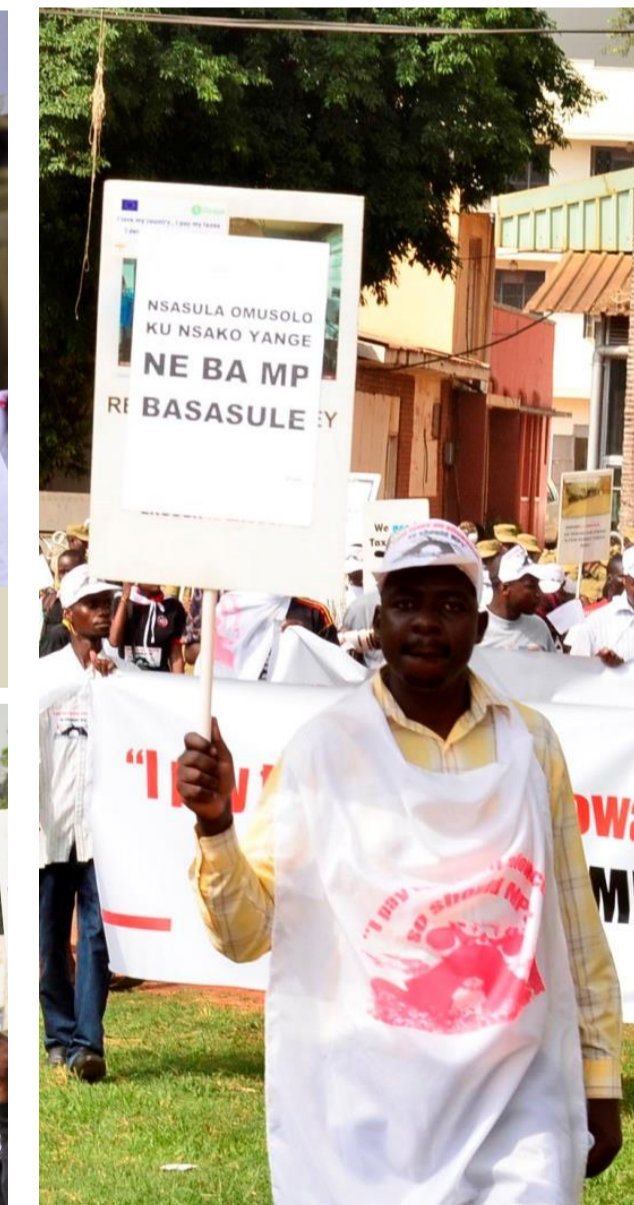
This gentleman spared two hours that day to match with others- to put his message across 'MPs paying taxes on their allowances' pertinent to him