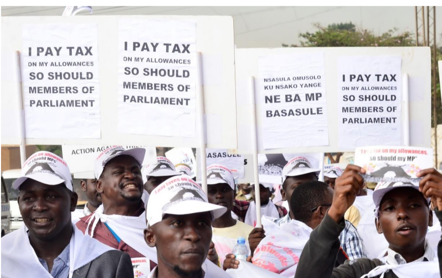
Citizens holding placards and while chanting slogans of 'Tuswala ba MO basasule Omusolo'