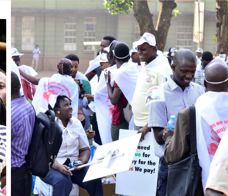
Citizens getting set for the march at railway grounds