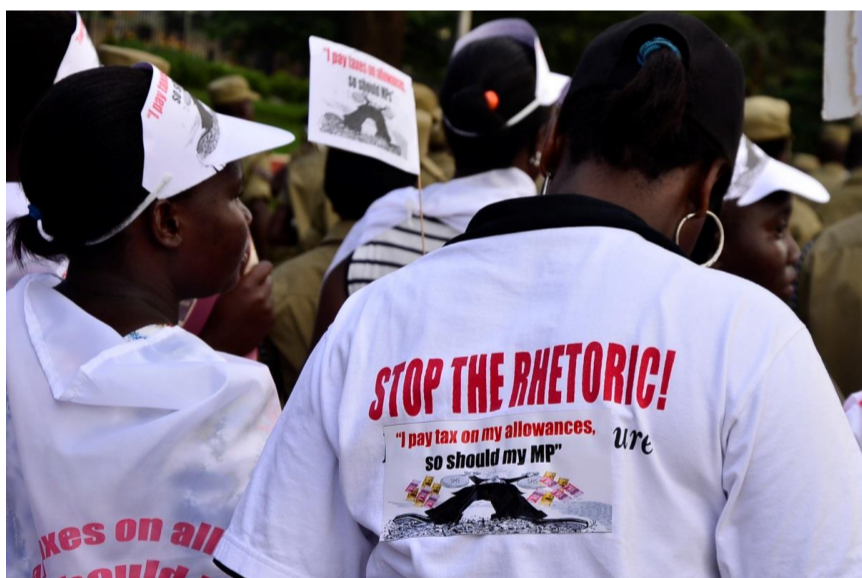
This lady's T-shirt says it all. MPs must be seen to supporters and saboteurs of development- MPs should Walk the Talk of contributing to increasing domestic revenue