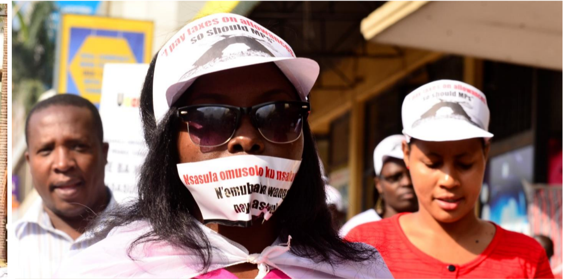
This lady creatively locked her lips with campaign sticker –displaying Luganda message