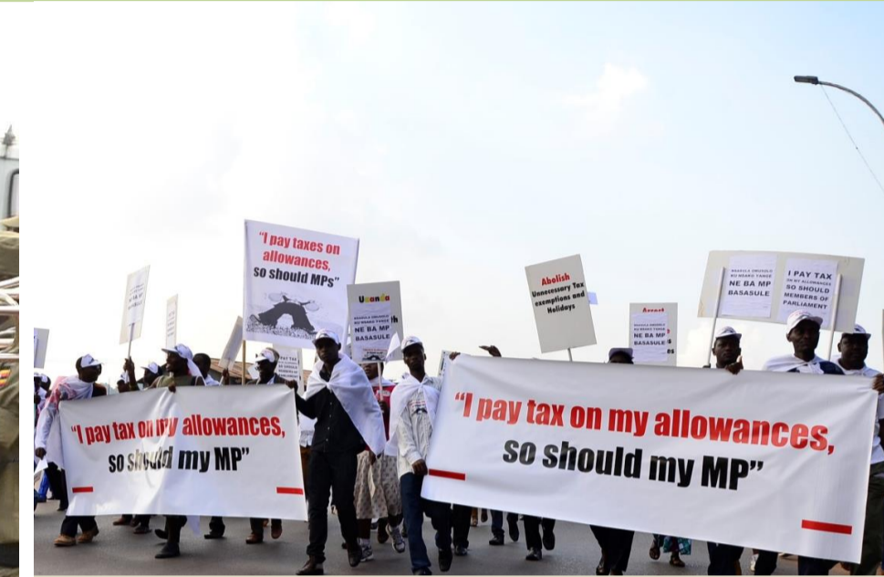
Banners displayed with clear campaign message