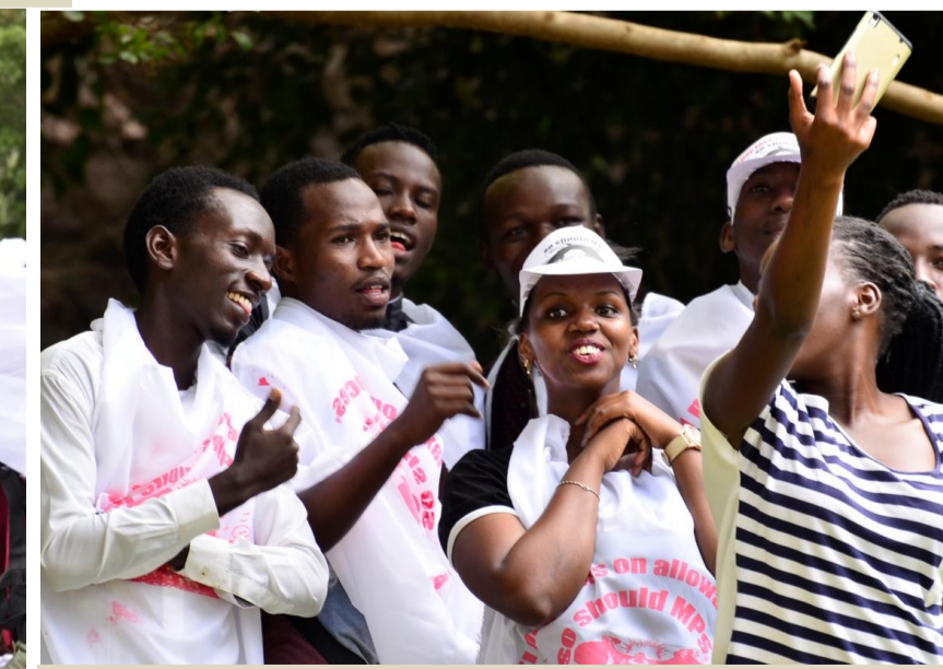
Young people having a light moment through taking a 'Selfie' after marching from railway grounds to IMA show grounds