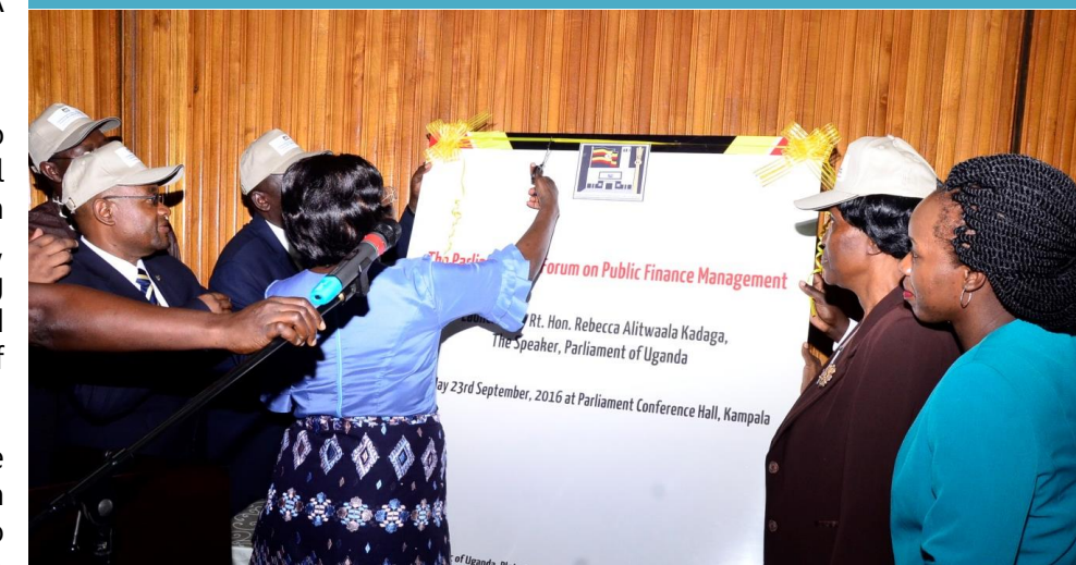
The Rt. Honorable Speaker Rebecca Alitwaala Kadaga launched the Parliamentary Forum on Public Finance Management at the Parliament Conference Hall, 23rd September 2016.