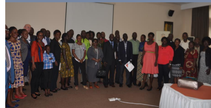
Some of the participants in a group picture at the end of the High Policy dialogue on Gender Based Violence that was held at Protea Hotel in Kampala last week.