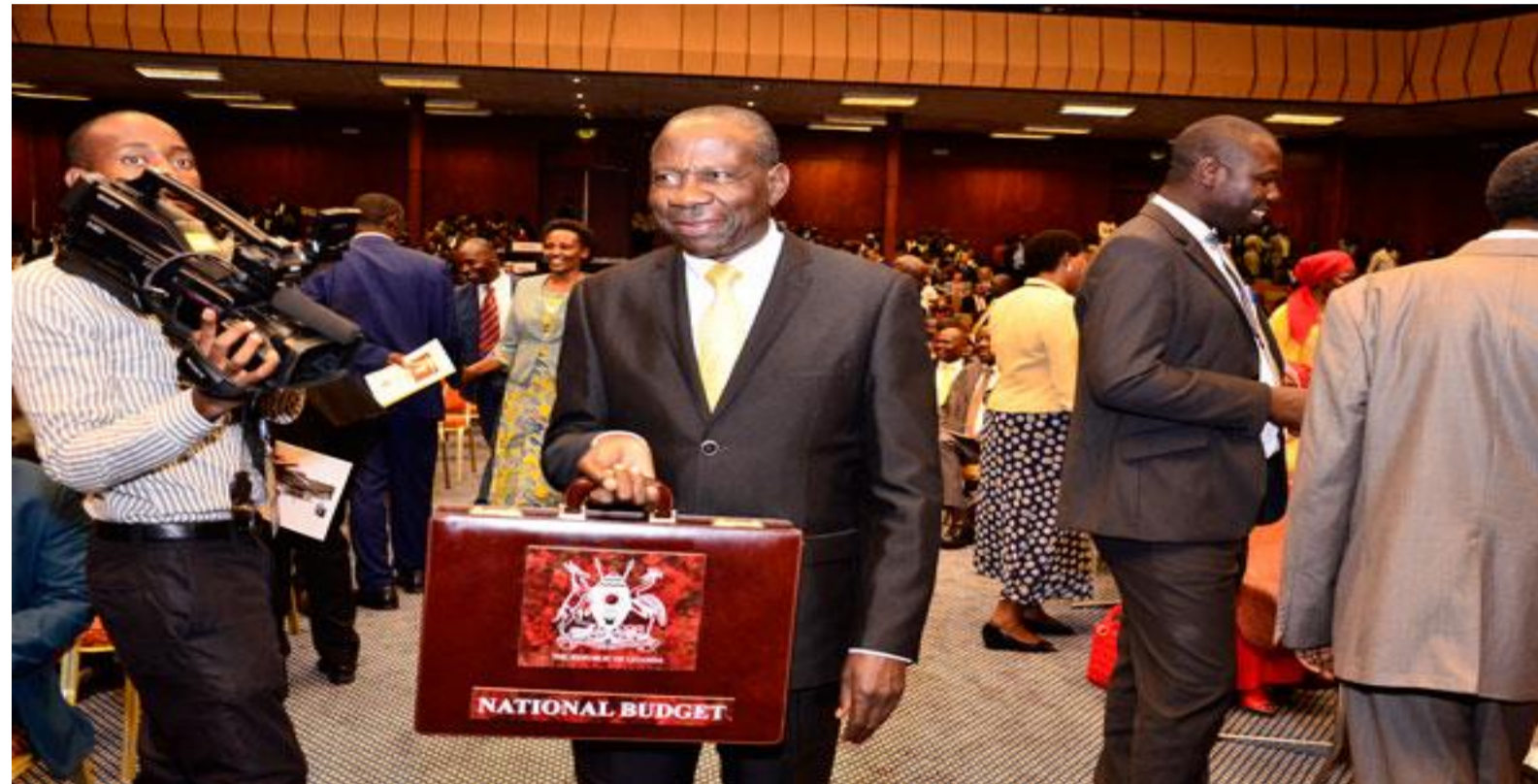
Finance Minister Matia Kasajja holding the ceremonial National Budget briefcase at a past Budget reading day. The 2016/17 Budget Performance report was tabled last week in Parliament by David Bahati, the state minister of Finance in charge of planning.

The annual budget performance report for the financial year 2016/17 has highlighted low absorption and late release of funds as some of the challenges that affected service delivery and timely implementation of the budget. Tabled before parliament on Tuesday last week, the annual budget performance report provides an assessment of budget execution, during the FY 2016/2017. It illustrates performance of resources and expenditures and provides vote level physical achievements across Government. The Fiscal policy for FY 2016/17 focused on supporting the maintenance of macroeconomic stability, stimulating economic growth and reducing Uganda's infrastructure deficit while keeping the country's debt at sustainable levels. According to the report, to support the budget, Government continued with the target of an annual increase in the tax-to GDP ratio of 0.5 percentage points.